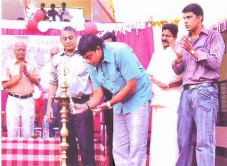
Senate Inauguration 2009.chief guest Mr.Franko Simon lighting the lamp

The Student senate inauguration and Fresher's Day Celebration was held on 26-11-09. Mr. Franko Simon, Play back singer was the chief guest. Cultural and Entertainment events were conducted after the inauguration.