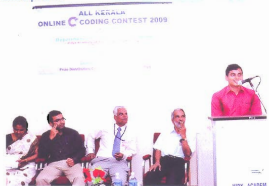
C Coding contest 2009 Prize distribution ceremony