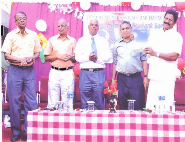
The College Magazine "Undulations '09" being released.