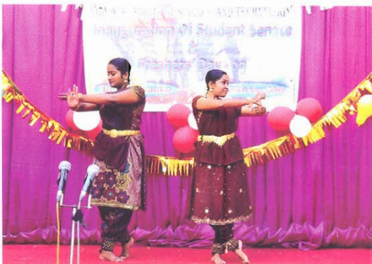
Students performing the welcome dance during Fresher's Day '09

The Student senate inauguration and Fresher's Day Celebration was held on 26-11-09. Mr. Franko Simon, Play back singer was the chief guest. Cultural and Entertainment events were conducted after the inauguration.