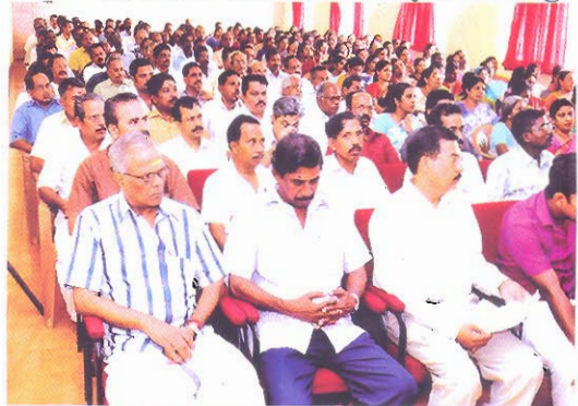
A section of the audience at the PTA general body meeting 2009